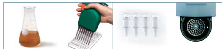
ENRICHMENT SAMPLE PREP AMPLIFICATION DETECTION

Contact BioControl today and discover how the many advancements of Assurance GDS can improve your performance – and advance your world.